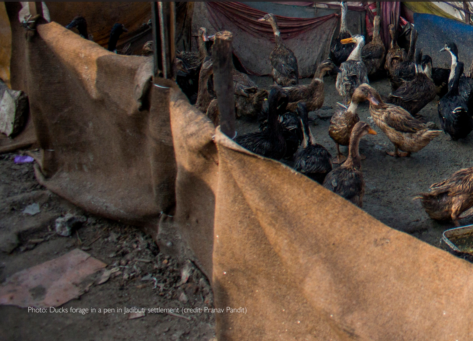
Photo: Ducks forage in a pen in Jadibuti settlement

At the time of sampling, little information was available concerning AMR in Nepal in general and in urban, informal settlements such as Jadibuti in particular. Therefore, science to characterize resistance genes from a One Health perspective was needed to allow for more targeted discovery of specific resistance reservoirs in this community and in underserved settings similar to it.